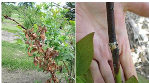
Wilted leaves on dying cane (left) and Phomopsis lesion (canker) on cane (right).

The big question is when these infections took place. My best guess is they happened last year (2014) during rainy periods in mid- to late summer or even early fall. Symptoms on two-year-old canes suggested a similar scenario in 2013. Both summers were cool and relatively wet in comparison to 2012. Phomopsis overwinters in old, infected canes and twigs, which are a ready source of inoculum hovering over the new growth. Phomopsis spores are splash-dispersed by rain and irrigation water. While peak spore release usually occurs in April and May, the fungus may be active all summer into early September, even producing a second crop of