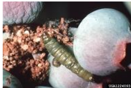
Cranberry Fruit Worm maggot.

•Cranberry Fruit Worm adults have been seen in some plantings. They lay their eggs at the base of the newly set fruit. The larvae is greenish and about a half inch long with brownish red markings on the back. Lured traps are helpful to assist in spray timing. Two sprays are often needed to control them – there are many different effective products.