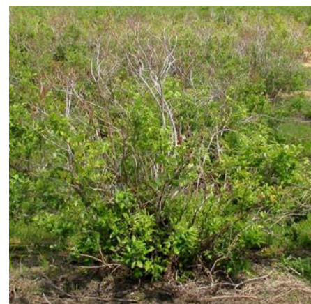
Winter injury affecting mostly older canes.

As soon as possible after pruning, apply an effective fungicide with ground equipment to protect young canes and pruning wounds from infection, ensuring the lower part of the bush is well-covered. If you are applying sprays for fruit rots anyway, keep a nozzle aimed at the base of the bush. As for fungicide options, Pristine (zero-day pre-harvest interval or PHI) and Quash (seven-day PHI) would probably be the most effective. Indar, Tilt and QuiltXcel are also effective, but have a 30-day PHI. Aliette, or other phosphite material, or Ziram could also be used, but are not as strong. The best options for organic growers are Sil-Matrix, Serenade and Double Nickel 55, which are expected to provide moderate protection.