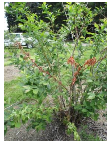
Cane dieback in blueberry field.

While we are still trying to determine the causal agent of the outbreak, the fungal pathogen Phomopsis appears to be the likely culprit, possibly in conjunction with secondary fungi that move in after Phomopsis . In surveys in Michigan blueberry fields in recent years, the fungus Phomopsis vaccinii was the most common pathogen found in dying canes. While cultivars Jersey and Berkeley are known to be rather susceptible to Phomopsis , cultivar Bluecrop is generally considered resistant. However, we discovered in inoculation experiments that current-season growth of Bluecrop is highly susceptible to Phomopsis infection, much more so than in Jersey and Elliott. This phenomenon has also been observed in field situations, where new growth of Bluecrop was repeatedly infected to the point that bushes were not able to outgrow the disease and remained small.