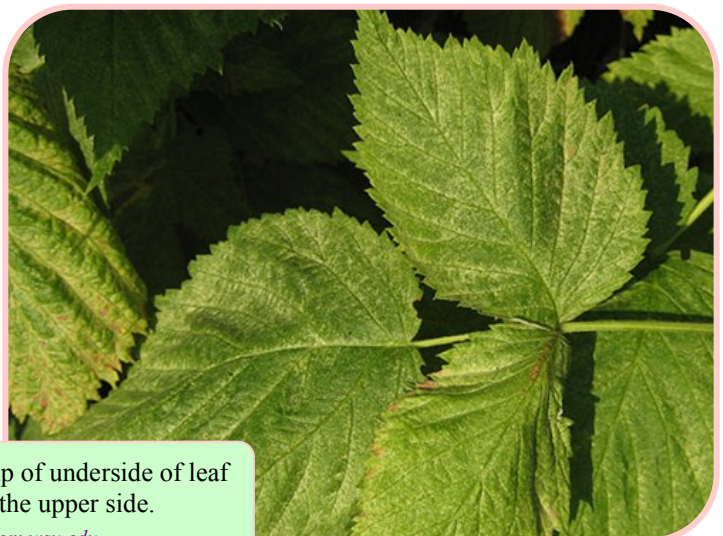
Photos show close-up of underside of leaf and the stippling on the upper side.