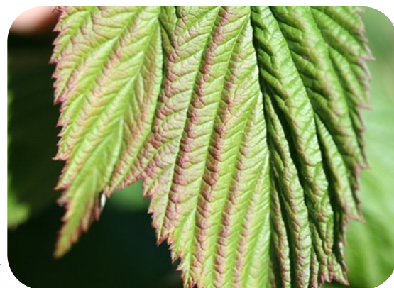
Foliar purpling of raspberry indicative of Potassium deficiency.

Blueberries: harvest should be complete in most locations just after Labor Day. Most farmers had a banner year and the regrowth even in stressed plants looks promising. Those of you that were able to take tissue samples should make the recommended nutrient applications this fall – everything