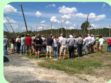
2013 Hops 101 Participants visiting Dutchess Hops

Topics are subject to change. $60/person, includes lunch. Call 845-677-8223 ext. 115 for more information. Email nh26@cornell.edu to register.