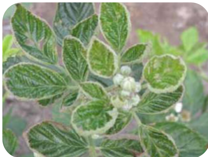
Boron toxicity symptoms resemble deficiency cues, especially in Brambles.