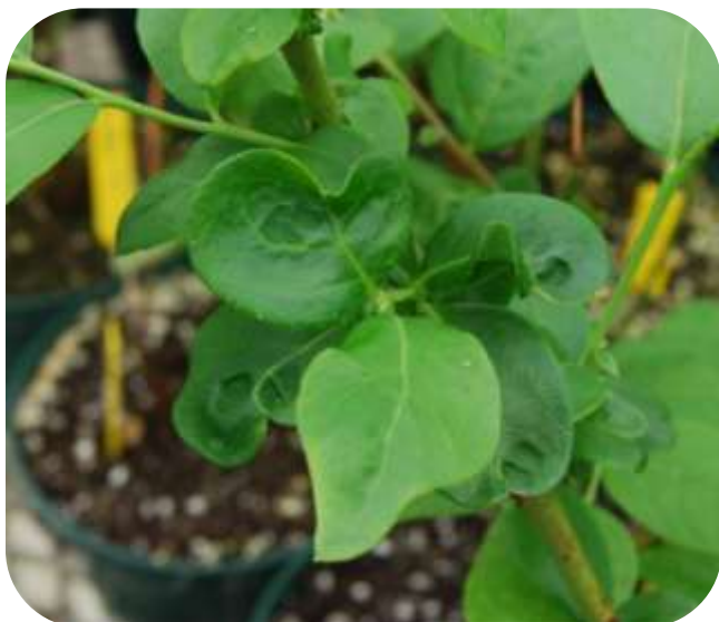
Deeper and abnormally-shaped young leaves and halted growing points are visual indications of boron deficiency.

Boron deficiency in blueberry generally develops in young leaves, which appear darker green and deformed with limited leaf expansion, twisted leaf margins, and deep dimples forming on young leaves. When deficiency is severe, the growing points stop growing, resulting in loss of apical dominance. Causes of boron deficiency include high soil pH (above 6.8) or the use of a fertilizer that lacks Boron. Lowering soil pH to 5.0-to-4.5 is recommended for improving the availability of Boron.