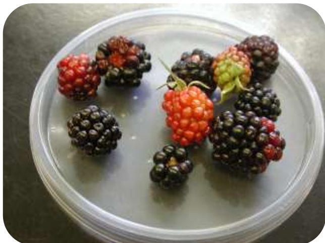
SWD oviposition in immature blackberry

More information on conventional and organic management options for NYS grown small fruit can be found here: http://www.fruit.cornell.edu/spottedwing/pdfs/swd-insecticides-berries-ny.pdf .