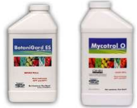
BotaniGard ES ( Beauveria bassiana spore formulation).