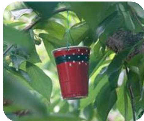
SWD red solo cup trap.

Cornell's SWD web site hosts a map of the counties in which SWD is being trapped; updates on presence based on trap findings can be found here: http://nysipm.cornell.edu/invasives_exotics/swd/swd.asp .