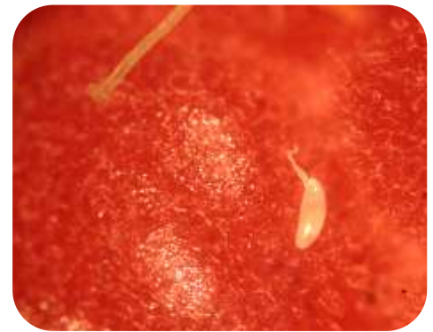
SWD egg on raspberry.