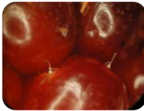
SWD egg and respiratory horn on raspberry.