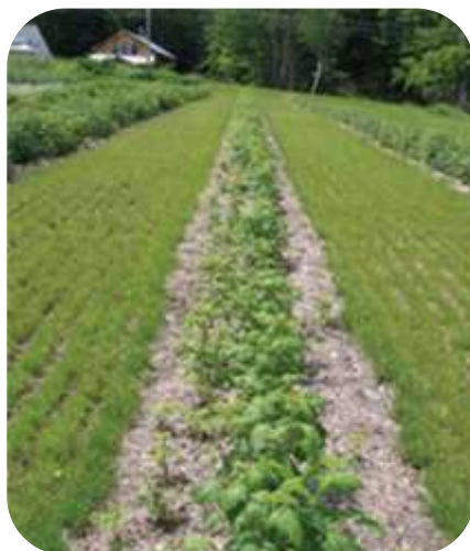
Pruned primocane berries emerging in spring with cover crop on both sides of row.

Plant growth can be manipulated by growers to achieve long-term increases in production of quality fruit. Pruning and trellising affect plant growth rate, fruit quantity and size, soluble solids (sugars), disease susceptibility, ease of harvest, and spraying efficiency. Brambles respond significantly to pruning and trellising, but these practices are usually the most expensive and time-consuming part of an operation. Growers must use care when choosing pruning and trellising strategies.