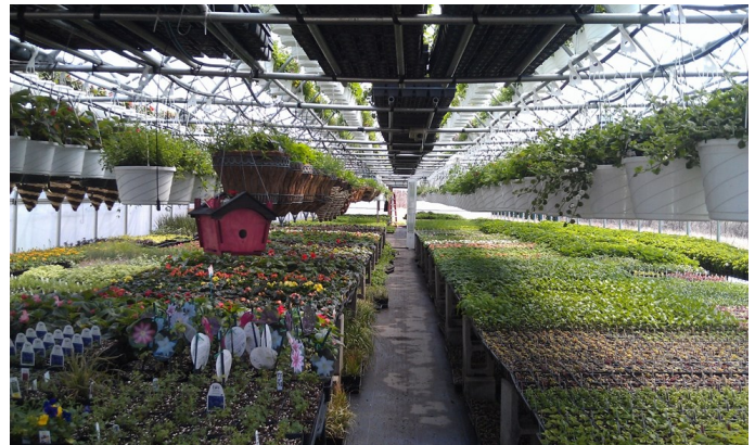
Image: a greenhouse hoping to move some baskets for Mother's Day so that the rest of the plants have enough light and space. Remember that some flower can harbor vegetable diseases (petunias to tomatoes, for example) so stacking plants is a disease liability.

Greenhouses are absolutely packed, and growers know they need to move some plants for the health of their entire houses. The warm weather and Mother's Day should help bring plant densities back down to a reasonable level.