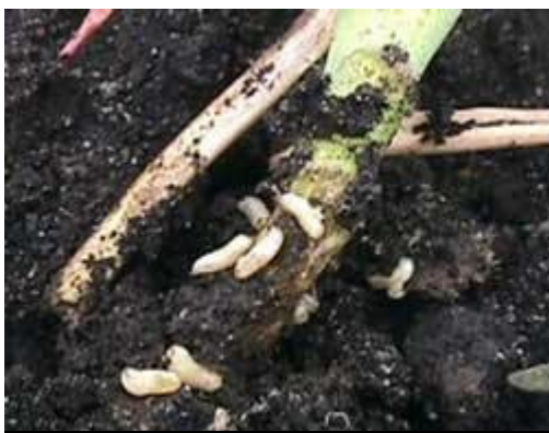
Figure 1: Cabbage maggots feeding on cabbage stems: maggots are legless, tapered and white in color, and are usually less than 1/3 inch in length.

In the last week I've seen quite a few brassicas going in the ground and with the soils starting to finally warm up, they are getting off to a fairly good start. Cabbage maggot is the pest to be thinking about right now. Cabbage maggots can stunt or kill young plants as a result of root feeding. I have also seen where this feeding injury may not kill the plant outright but leaves a wound for other diseases to get in and started and finally finish the job. Don't forget that cabbage maggot can also attack other crops such as turnips, radishes and daikon (all in the Brassica family).