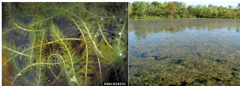
Images: closeup of Milfoil and an infested lake

Eurasian milfoil is an invasive aquatic weed that is choking out many lakes and ponds. There are services that remove it by the truckload in an attempt to control it, and Fledging Crow Farm in Keeseville has been trying various ways to this waste milfoil as a soil amendment. They have added it to their compost piles, tilled it into their fields and used it as a mulch under tomatoes in a high tunnel. For more information or to share any experiences others have had with it, contact Ian at http://www.fledgingcrow.com/