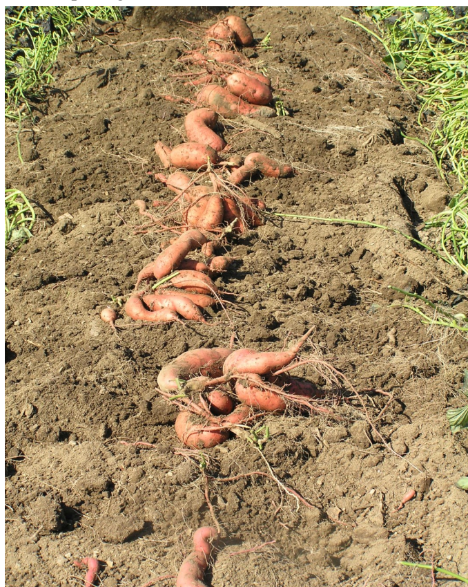
Sweet potato roots waiting to be picked up.

Ideal curing conditions are a temperature of 85°F with 90% humidity for 5-7 days. At this time of year empty greenhouses can be an excellent place to cure sweet potatoes, but there are a couple of things that need to be done. First, floors of the greenhouse should be watered several times a day in order to keep