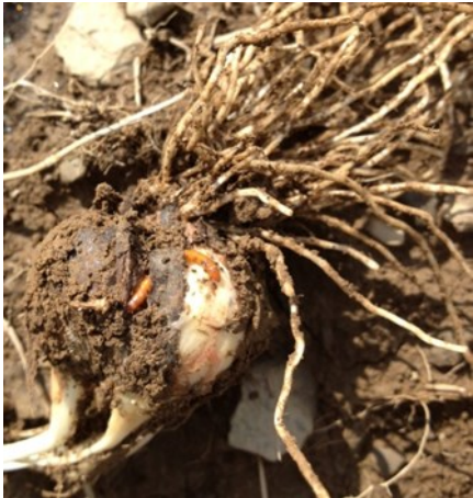
Garlic infested with wireworms. Wrapper leaves have been eaten off.

being applied in the fall, when it is easiest, and 25% quick-release forms like Chilean Nitrate being applied in the spring. Some organic growers are opting to put down all N in the fall, particularly in mulched systems. This can be tricky in a cool spring when N doesn't become available