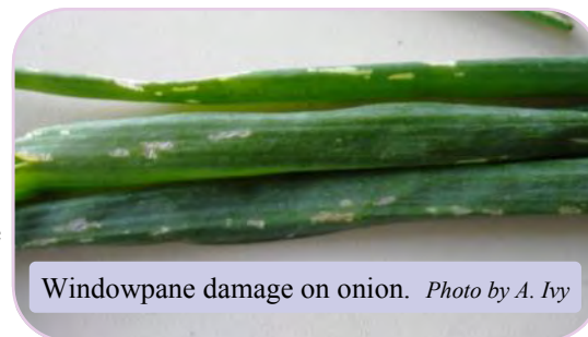
Windowpane damage on onion.