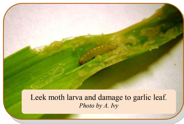
Leek moth larva and damage to garlic leaf.

For more information and resources concerning leek moth visit the Information Center for the U.S. at: http://web.entomology.cornell.edu/shelton/leek-moth/ -ADI