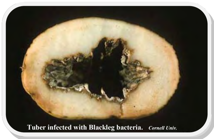
Tuber infected with Blackleg bacteria.

Tubers of infected plants may show symptoms ranging from slight vascular discoloration at the stolon end to wet breakdown of the entire pith, extending inwards from the stem end. The bacterium can enter tubers through stolons and produce various symptoms on the tubers. The most pronounced symptoms appear near midseason. Inky-black,