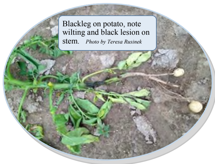
Blackleg on potato, note wilting and black lesion on stem.

slightly sunken lesions develop at the stem end of the tuber. The flesh of the tubers is cream colored, gradually turning to grayish and finally black. Irregular cavities with blackened walls may extend through the center of the potato tuber. The blackleg organism may also infect lenticels, causing them to be slightly sunken and brownish to black in color. The infected lenticels can be up to 1/4 inch in diameter. The tissues under the infected lenticels are brownish and usually dry. This extends less than 1/8 inch into the tuber flesh. New tubers from infected plants may become soft and slightly discolored in the vascular tissue at the stem end. In advanced stages, the center of the tuber will be decayed, leaving only an outer shell. Spread in storage is minimal.