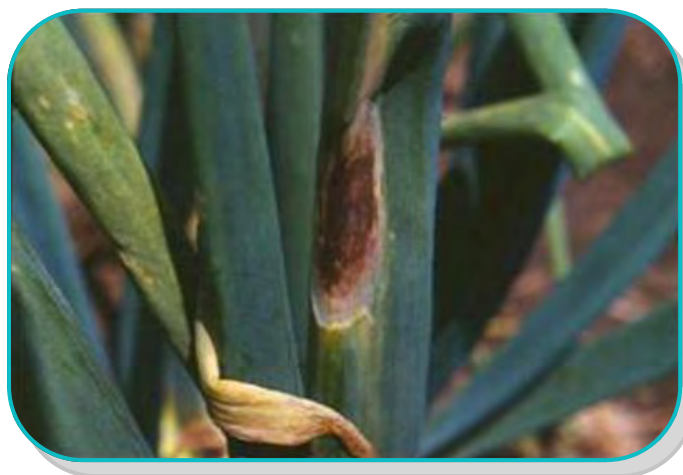
Purple blotch lesion.