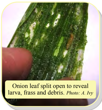
Onion leaf split open to reveal larva, frass and debris.