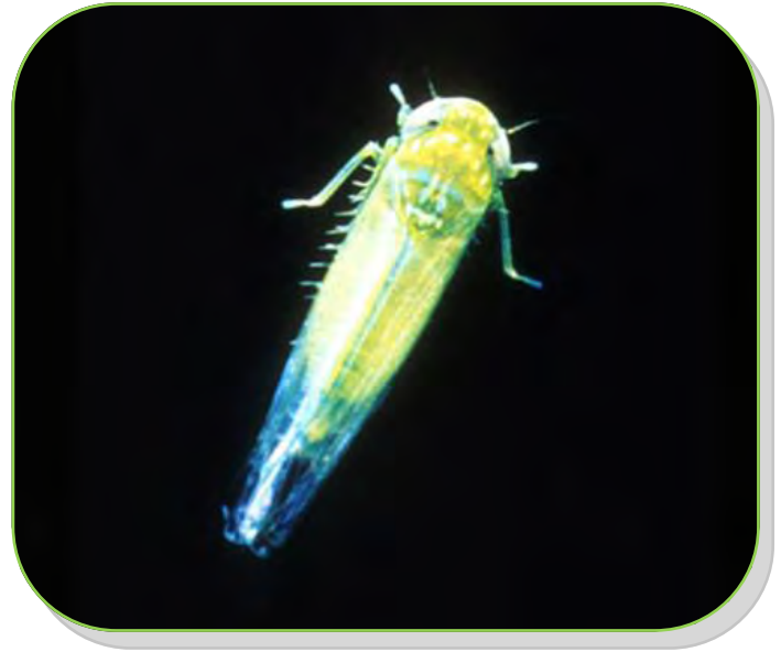
Potato leafhopper adult.

To scout for hoppers walk through the field and rustle the plants. If you see small light green bugs hopping about you have them. To truly assess populations for treatment it is best to use a sweep net. Adult is wedge-shaped, iridescent green in color, and 1/8 inch long. The body is widest at the head. If one or more than 1 adult is captured, on average, in the sweeps, it is time to treat. If you don't have a sweep net, you can also count nymphs. Nymphs look similar to the adults but are smaller, slightly less wedge-shaped, and do not yet fly. They will move quickly around the leaf, however. The threshold for control is 15 nymphs per 50 leaves.