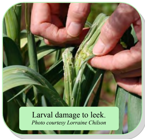
Larval damage to leek.