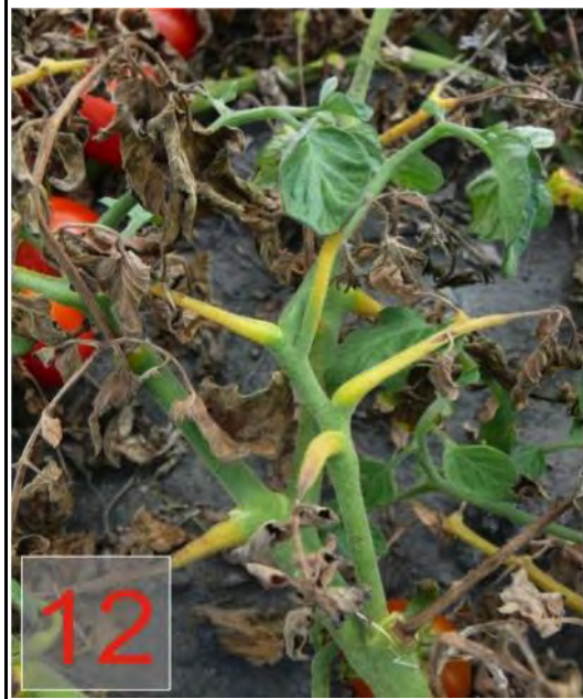
All Photos (adapted) courtesy Meg McGrath, Long Island Horticultural Research and Extension Center. Image 11 upper two photos courtesy of Ontario IPM-Ontario Ministry of Agriculture, Food and Rural Affairs, lower photo U-California Cooperative Extension-Ventura County. Image 12 photo (adapted) courtesy Janice LeBoeuf, Ontario Ministry of Agriculture, Food and Rural Affairs.