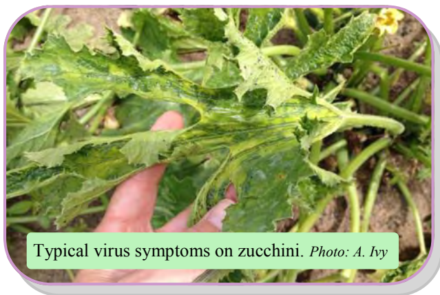
Typical virus symptoms on zucchini.

This farm had an explosion of aphids in just a matter of days, on all their cucurbits but especially on cucumbers, zucchini, acorn squash and pumpkins. It will take more than a spray or two to bring this population down to tolerable levels. They could start with an application of Assail, followed a week later with Lannate, and then weekly thereafter with a rotation of products to avoid resistance. Organic growers need the spray to come into contact with the aphids and since they're on the undersides of the leaves this can be quite challenging to accomplish. If caught when the aphids first appear, excellent results have been seen with two applications of Fulfill (pymetrozine) 7 days apart. There are several products labeled for aphids in cucurbits. Check the Vegetable Guidelines, section 17.6.1.