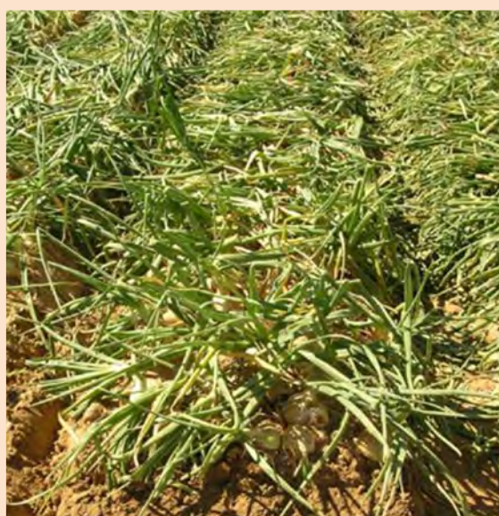
A field of onions with the “tops down”.

In some cases, to hasten the maturation, onions are rolled using empty drums to knock the crop down. This has to be done carefully. If the onions are not ready this process may pull them prematurely from the soil creating a mess in the field. Rolling is no longer regularly practiced unless, due to imminent weather system, harvest needs to be expedited or heavy rains falling in the neck of the onion will cause increase in bacterial infection rates.