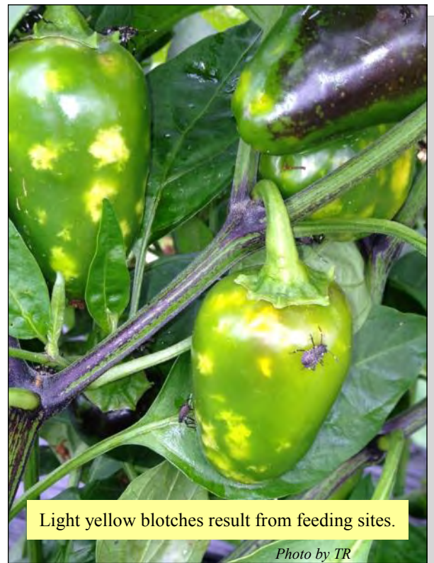
Light yellow blotches result from feeding sites.

This is a critical time to check fields for BMSB, especially if you know they are in your area. I would check all crops as I've seen BMSB feed on all sorts of fruits and vegetables including: green beans, tomatillos, even leafy greens. I would especially check any field edges that are bordered by trees or brush/weeds. Damage typically begins along those field edges. Inspect fruit for damage and confirm the presence of stink bugs by searching the undersides of foliage, and fruits for eggs and nymphs. BMSB are elusive and not easily observed in low numbers. No specific thresholds have been established. If found, treatment may be necessary to reduce feeding and injury. Several insecticides are labeled for stink bug control on peppers and tomato and can be found in the Cornell ICPM Guidelines for Commercial Veg Production ( http://ipmguidelines.org ). Management of BMSB in organic production is very challenging. Peter Jentsch, Entomologist at the Hudson Valley Lab, is currently evaluating efficacy of several organic materials. If you have any questions please feel free to email me at tr28@cornell.edu or call 845-389-3562. If you do see BMSB in your veg plantings, I would appreciate you letting me know as we are monitoring distribution and population levels. -TR