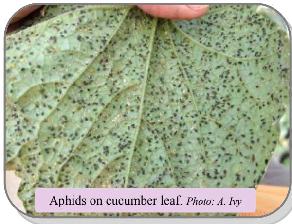
Aphids on cucumber leaf.

The aphid population on the cucumber leaf in the photo at right is at a level that will be very difficult to bring under control. You have to turn the leaves over to catch this and many other pests. From above, the leaves often show only subtle symptoms at first. Squash bugs and cucumber beetles are other common pests of cucurbits that must be caught early. Begin checking for aphids when the plants begin to form runners.