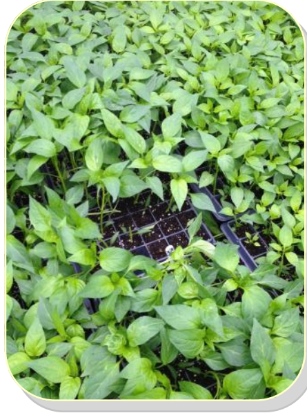
Pepper transplants showing Iron deficiency (light green new growth) due to high media/soil pH.

Start with the media – Acidic media like sphagnum peat, coir, pine bark and composts are usually acidic. Alkaline