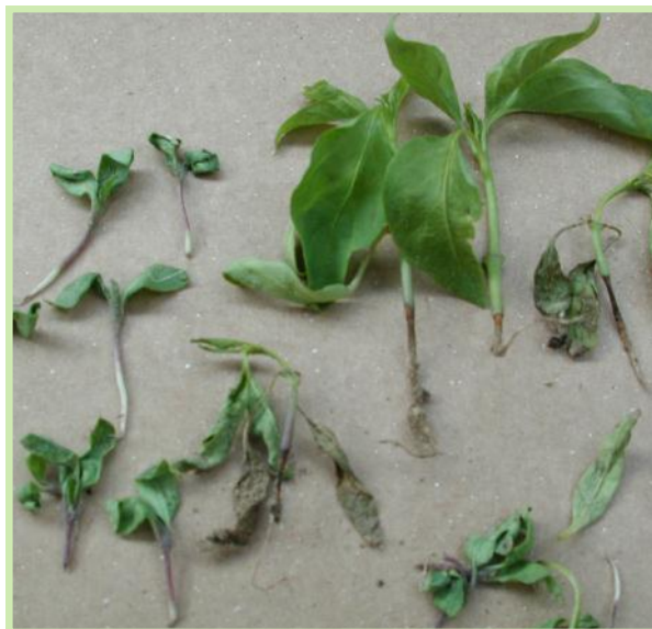
Dampening off of pepper seedling