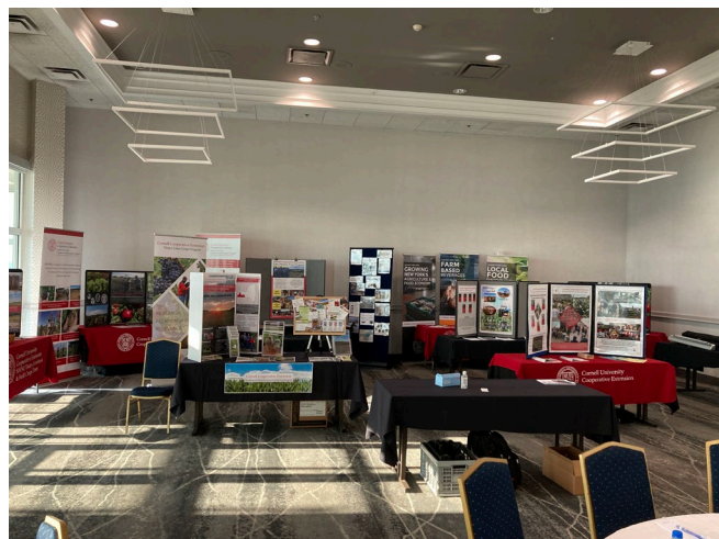
Poster and promotional materials displays of the CCE Regional Ag Teams at the Professional Development Retreat held June 22-24, 2022 in Geneva.