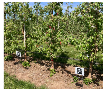
QR scan signs are placed on stakes in preparation for Liz Tee to perform scans (counting fruitlets) with Farm Vison, one of the several precision ag companies we are working with.