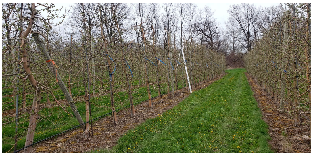
Honeycrisp trees are flagged for a precision target bud load experiment in an orchard in Orleans County.