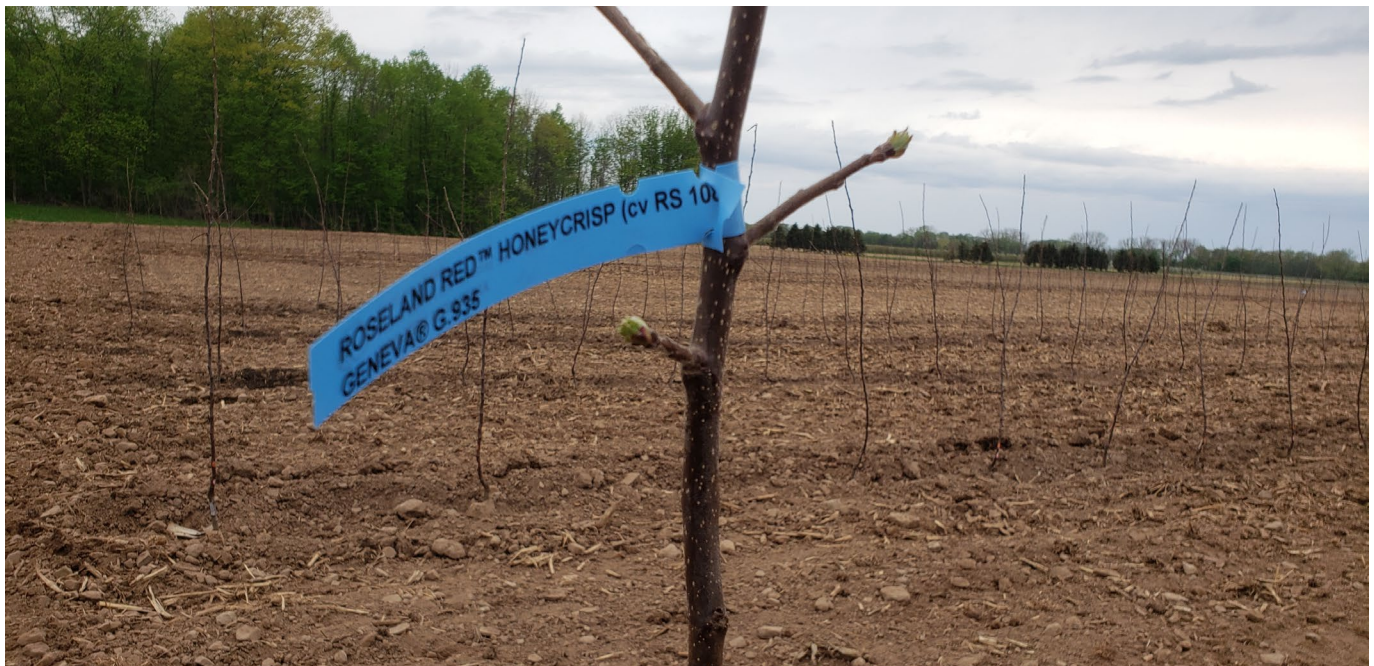
A new Honeycrisp strain grafted onto a Geneva rootstock breaks bud in a new apple orchard planting in Niagara County.