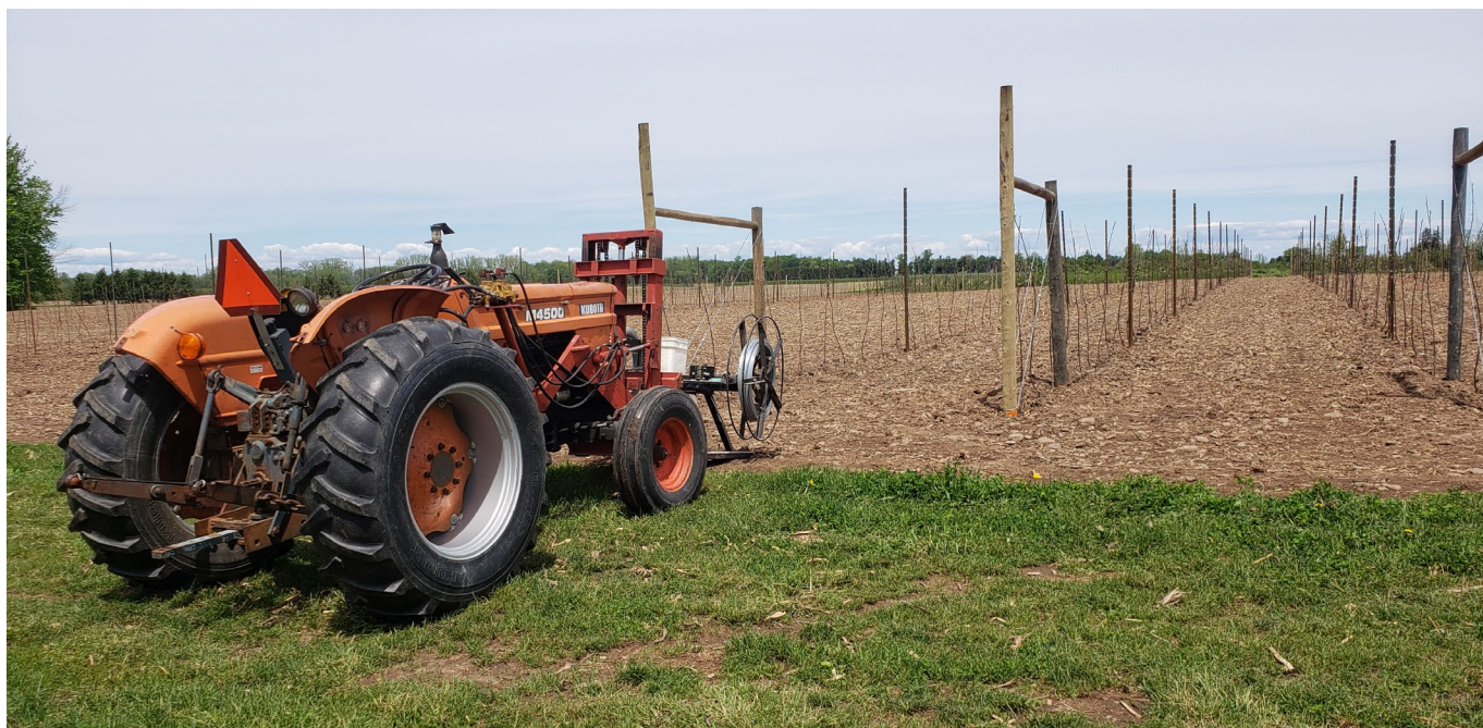
A tractor is prepped to string trellis wire in a new apple orchard planting in Niagara County.