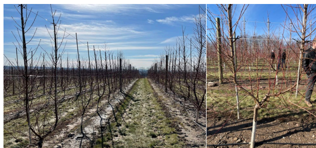
Two-dimensional (in-row) peach systems are observed near Hart, MI at the IFTA Annual Winter Conference on February 14 th , 2023.