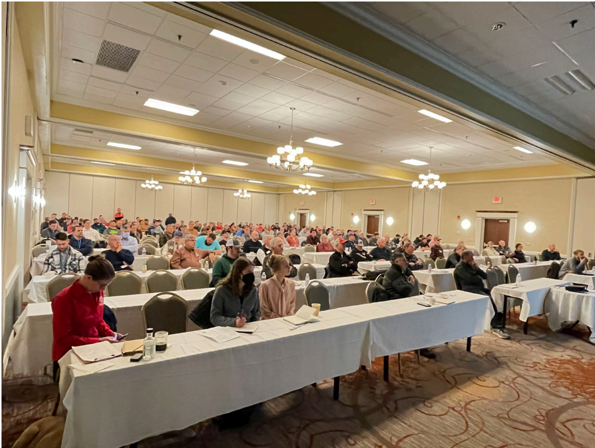
Attendees hear a talk at CCE-LOF's Western NY Fruit Conference in Henrietta, NY on February 28 th , 2023.