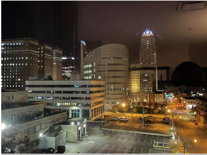
The nighttime view from Embassy Suites Buffalo, host of the Annual Great Lake Fruit Workers Conference in Buffalo NY on November 1-3.