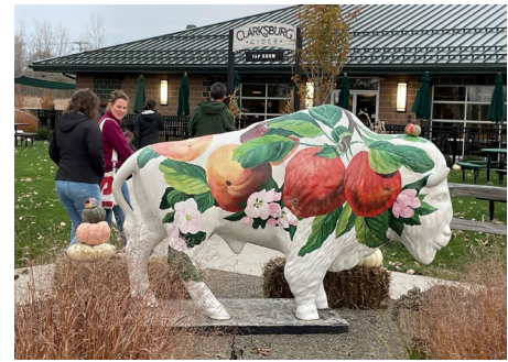
Clarksburg Cider in Lancaster, host of a tour and banquet dinner at the Annual Great Lakes Fruit Conference in Buffalo on Nov 2.