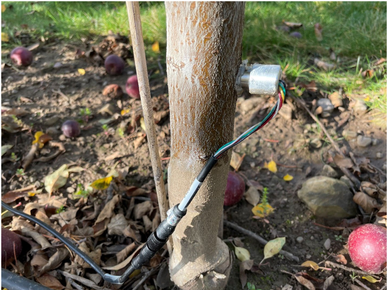
A FloraPulse irrigation sensor measures water availability directly from the trunk of a Gala tree in Appleton, NY.