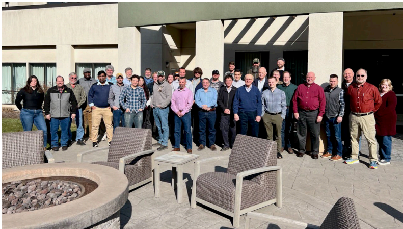
Attendees pause for a group picture at the Annual Northeast Plant Growth Regulator Meeting in Wilkes-Barre, PA on March 13.