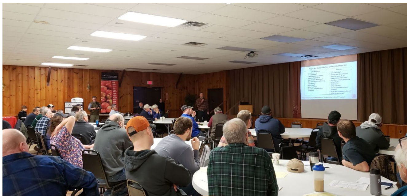
2019 Lake Ontario Winter Fruit School Niagara County Site