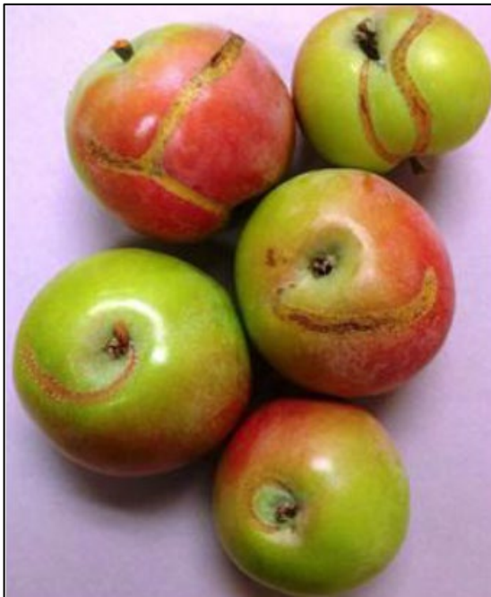
European apple sawfly damage is characterized by its russeted, spiraled scars.

Certain insecticides that control this pest also adversely affect bees, which can pose a problem at petal fall because certain apple varieties lose their petals before others. In blocks of trees where petal fall has occurred on one variety but not the others, the variety that has lost its petals is likely to sustain some curculio or sawfly injury until an insecticide is applied.