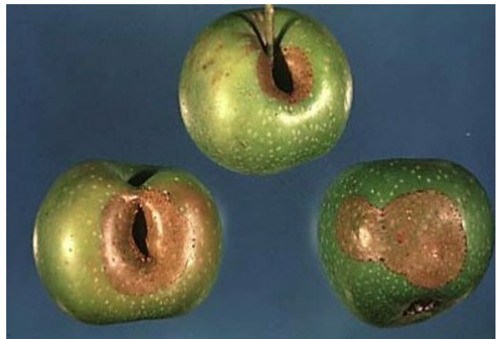
Damage caused by overwintering OBLR larvae around the petal fall timing.

As you're looking through your buds this time of year, it would be prudent to have a quick look for later-stage larvae in problem blocks to determine whether a treatment against the overwintered OBLR brood should be included in your petal fall plans. Scout the blossom clusters or foliar terminals for larvae feeding within both the flowers and rolled leaves; a 3% infestation rate could justify an application to minimize overwintered fruit damage and help reduce summer populations (there's a sequential sampling chart to facilitate this process on p. 73 of the 2022 Guidelines). A fact sheet with photos and descriptions of this insect's life stages can be found at: https://hdl.handle.net/1813/43111 .