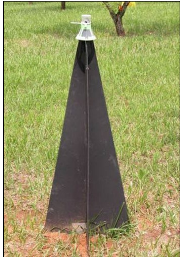
Pyramid traps can be used to monitor PC migration into known hotspots within the orchard.

Recall that, in addition to the industry standard broad-spectrum materials such as Imidan , some additional options may be considered: Avaunt and Actara are effective for plum curculio in apples and pears, and Avaunt is also labeled in stone fruit. Another option would be Exirel or Verdepryn , diamides with strong efficacy against this pest. Delegate, Assail, and Altacor all have some activity on PC, but should not be considered as the first choices in high-pressure blocks.