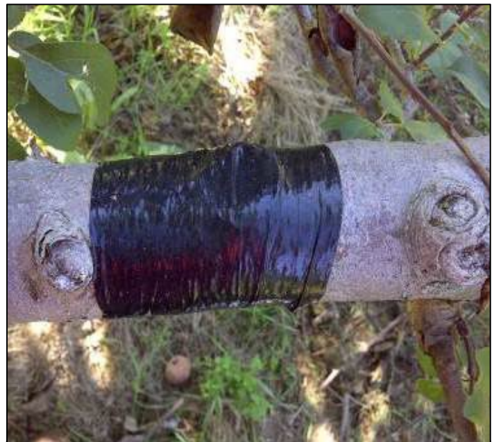
Monitoring for SJS crawler emergence with double sided black tape around tree limbs.

In the Geneva area, first crawler emergence has tended to occur sometime around mid-June. To monitor, place a piece of double-sided tape on branches to track initiation of crawler movement. If a treatment against this stage is needed, Esteem 35WP is one option. It should be applied at 4-5 oz/acre at first crawler emergence; a low rate (0.25% or 1 qt/100) of a highly refined summer oil (see above) has been shown to improve penetration and, therefore, control. Additional products showing control efficacy include Centaur (except Nassau and Suffolk Counties), Movento (most effective when applied at PF-1C and mixed with an organosilicone or nonionic spray adjuvant), Sivanto Prime , and Assail . Other options include Imidan, Admire, or pre-mixes such as Endigo, Leverage, or Besiege. These applications should also be effective against White Prunicola Scale, which has gotten to be increasingly common of in our area, in apples as well as peaches.