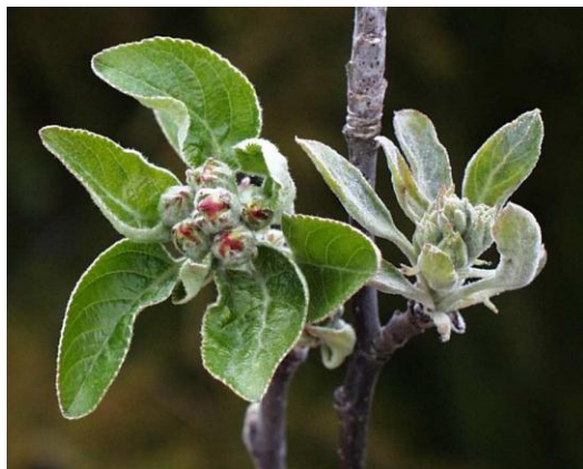
Figure 1. Overwintering mildew visible as a white powder on a stunted fruit bud (cluster shown on the right) compared to a healthy bud from the same tree (shown on the left).

Controlling apple powdery mildew is becoming more complicated because DMI fungicides are losing effectiveness against mildew in many orchards, and in some cases the strobilurin fungicides may also be losing effectiveness. Most mildew control failures result from (i) using fungicides that have lost effectiveness due to fungicide resistance; (ii) starting mildew control programs too late in the season; (iii) stretching spray intervals during dry periods when no scab sprays are needed; or (iv) poor spray coverage. As fungicide resistance in powdery mildew becomes more common, it will be critical to start mildew control programs before bloom and to rotate fungicides with different modes of action within seasonal spray programs.