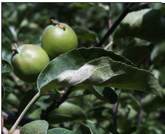
Figure 2. Mildew that overwintered in buds colonized this terminal shoot, producing what is often called a "flag shoot" because of the white foliage.

Controlling apple powdery mildew is becoming more complicated because DMI fungicides are losing effectiveness against mildew in many orchards, and in some cases the strobilurin fungicides may also be losing effectiveness. Most mildew control failures result from (i) using fungicides that have lost effectiveness due to fungicide resistance; (ii) starting mildew control programs too late in the season; (iii) stretching spray intervals during dry periods when no scab sprays are needed; or (iv) poor spray coverage. As fungicide resistance in powdery mildew becomes more common, it will be critical to start mildew control programs before bloom and to rotate fungicides with different modes of action within seasonal spray programs.