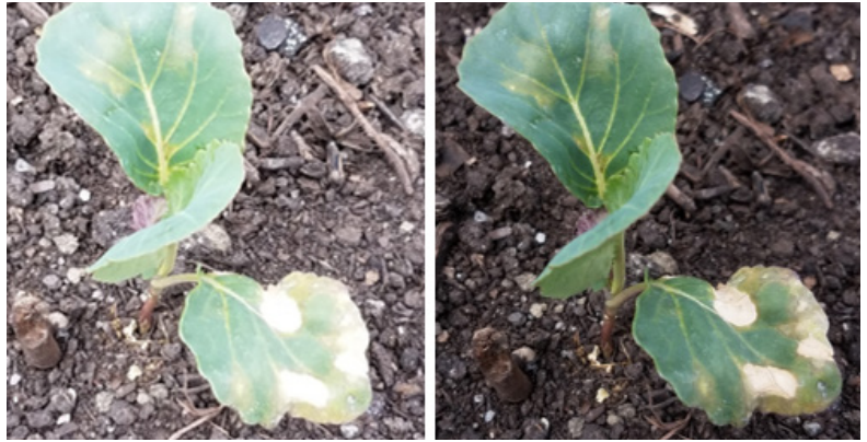
Adjust the lighting setting. Left: Overexposed image captured by just snapping a photo. Right: Same seedling, with white balance adjusted on phone so screen display matches what the eye sees; clearly shows the outline and wide range of discoloration (tan, bronze, yellow), which allows for a downy mildew diagnosis. The same diagnosis cannot be made from the image on the left.