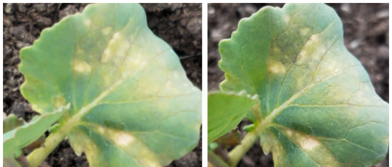
Use the portrait mode. Left: Necrotic leaf is blurry while the background soil is in focus. Right: By using portrait mode, the downy mildew infected leaf becomes sharp and isolated from the background soil. The added sharpness reveals the darkening lines and veins in the chlorotic upper left part of the leaf, despite the right image being taken from a greater lens distance than the image on the left.