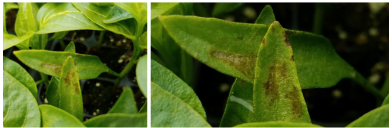
Correct focus point. Pepper seedlings with discoloration on the cotyledons. Left: Camera focused on leaves behind the scarring, leaving the lesion blurry and small. Too much extra foliage in the image. Right: Brought camera closer to subject, re-set the focus on the lesion, and stabilized the camera. These three actions yielded a sharper image that shows two different injury patterns – coppery sunken tissue in the center with no yellow margins and reddish-brown lesions with yellow margins moving in from the edge of the leaf.