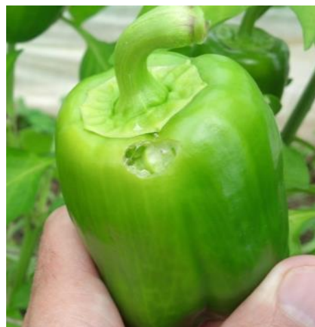
Tunnel slug damage on pepper. Managing pests of summer crops is key to having marketable winter greens.

For example in scouting tunnels this week we found low-to-moderate populations of slugs on peppers. The occasional pepper showed feeding damage as did foliage. In the meantime a lettuce crop is going in the ground as the peppers are gradually removed. This tender lettuce foliage will be more attractive to the slugs, and it since it is so small it can bear little damage before becoming unmarketable.