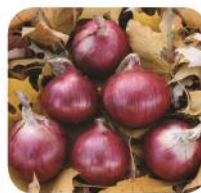
Red Sky Onion