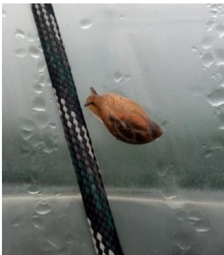
Tunnel slug.