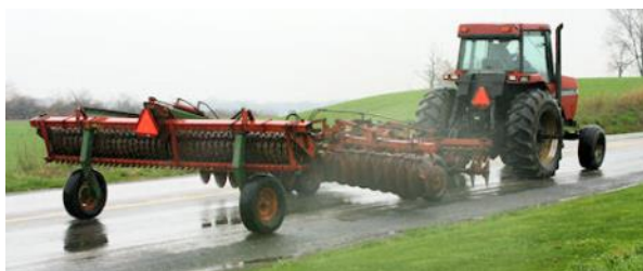
This tractor and disk/cultivator have SMV emblems.

While lights are the best way to warn approaching motorists that equipment is on the road, SMV signs and reflective tape remain visible if lights burn out. SMV signs fade with exposure to weather, but it is easy to add a new sticker on top of the old one. Reflective tape and fluorescent sticks can be added at the widest point of the implement to show