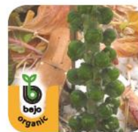
Nautic Brussels Sprouts