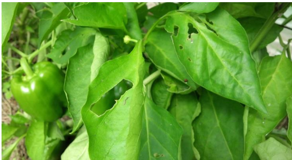
Tunnel slug damage of pepper foliage.