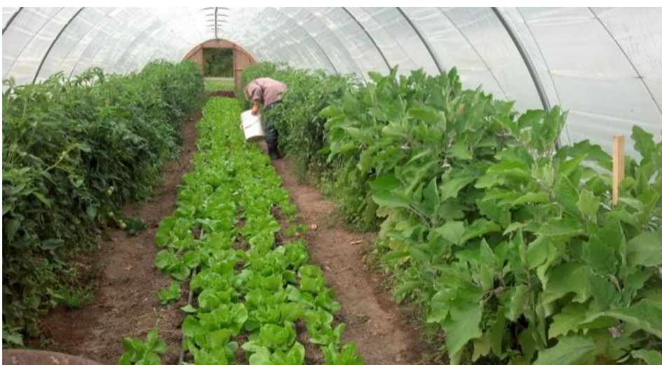
Farmers can increase profitability by stretching the summer crop season in to the winter greens season by combining or overlapping crops.

High tunnel profitability is largely dependent on fruiting summer crops, most often tomatoes. Cornell Vegetable Program (CVP) research has demonstrated gross revenue potential of over $6.00 per sq. ft. in well managed tomato crops. Winter greens may be less than half of this, however, the labor input is also lower, and the greens crop creates cash flow in the normally 'dead' time of year. One farmer recently shared that winter greens were the missing piece that now allows his farm to avoid borrowing operating capital each spring. So to make this system as profitable as possible farmers stretch the tomato season into greens season, often overlapping crops (see photos).