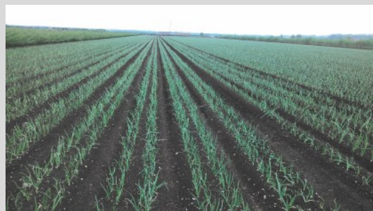
Figure 1. Early transplanted onions (bareroots) looking good with 3-4 leaves on 5/11.

Direct seeding is complete and transplanting is almost finished. The 2015 planting season was one of the driest onion growers in this region have seen in a while with several irrigating to stimulate even emergence and to prevent wind damage from blowing muck. Fortunately, enough rain fell Monday night just in time before Tuesday's 50 mph winds got a chance to cause any substantial wind damage – a narrow escape indeed! The direct seeded crop is looking really good with the majority in the flag leaf stage. Early transplanted fields have 3-4 leaves and are looking very good, especially where they have been irrigated (Fig. 1). Fields that were transplanted later into hot dry soil and exposed to temps into the 80s are suffering; fortunately, the change in weather to cooler temps and more rainfall will be a cool reprise and stimulate root growth. Rainfall came just in time to activate pre-emergent herbicides; keep your eye out for new flushes of weed escapes – see my “Wanted” ad (pg 2). Killing barley windbreaks is on the agenda this week – see article (pg 5).