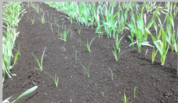
Figure 1. Yellow nutsedge in direct seeded onions in the flag leaf stage: this site is perfect to conduct a POST-emergent herbicide research trial for this difficult weed escape.

This year I am planning on conducting a series of POST-emergent herbicide trials to improve control of weed escapes in direct seeded onions. I am looking for muck fields that have a good selection of weed species (pigweed, lamb's quarters, ragweed, purslane, smartweed, etc.) but also sites with certain problematic weed escapes such as ragweed and mustards (Fig. 1). I'd like to make the first sprays at the flag leaf stage. If you have any good sites and would be interested in hosting a research trial, please contact Christy Hoepting at 585-721-6953 or cah59@cornell.edu . 📍