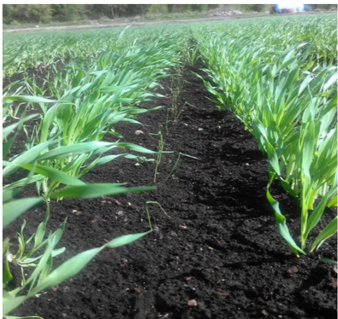
Figure 1. Barley wind breaks protecting vulnerable young onion seedlings from potentially ravaging 30 mph winds.