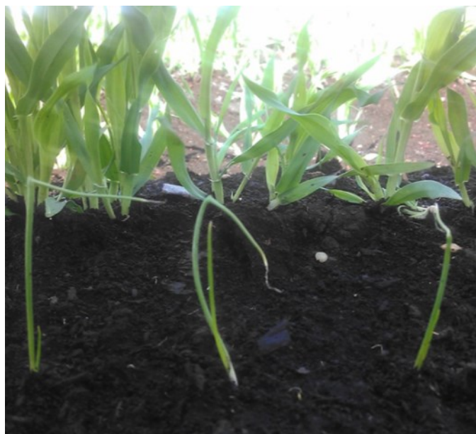
Figure 2. It's best to wait until the first leaf has started to emerge before applying herbicide to kill barley windbreaks to direct seeded onions in the flag leaf stage to ensure that the onions are large enough to withstand wind damage once the barley begins to die. ●