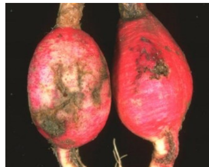
Figure 1. Cabbage maggot feeding damage on radish.

Protection from cabbage maggot is often needed in earliest plantings in the field and transplant beds. Unfortunately, once plants are established, there is nothing that can be done to control this pest. Particularly at sites with a history of cabbage maggot and during favorable conditions, preventative measures should be considered, especially during peak flight. Emergence of cabbage maggot adults (flies) can be predicted based on degree-day (base 40°F) accumulations, which is readily available at the NEWA web-site (Network for Environment and Weather Applications; http://newa.cornell.edu/ ); from the top menu, click on "pest forecasts" and then "cabbage maggot", and simply select the location that you are interested in. Highest risk of infestation is typically during peak emergence (50%) from the first and second adult flights , though later generations can also be damaging. Peak flights are indicated by the "50%" red dotted lines on the degree-day accumulation chart (Fig. 2). Seedlings, transplants or