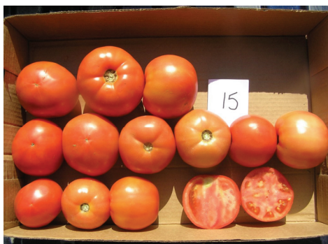
Figure 1: Examples of fruit grading according to size categories (Large top row, Mediums middle row and Small fruit on the bottom row). There are no Extra Large fruit in this picture.