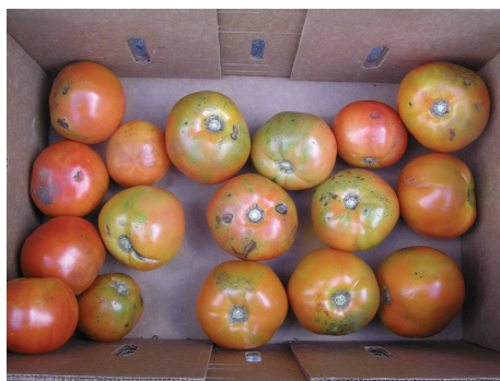
Figure 2: Box of fruit determined to be seconds according to grading criteria.