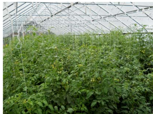
Photo on right: Aug 10. In this tunnel, the rows were set only 2 feet apart so the plants quickly filled all available space making harvesting and managing the crop a real challenge, and there is still over a month of growth and harvest to come.

Building Strong and Vibrant New York Communities