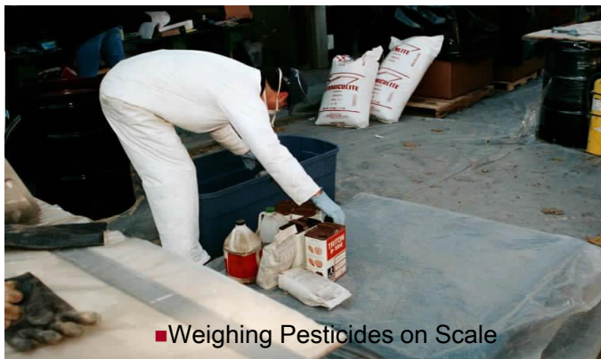
■ Weighing Pesticides on Scale

1.4 Million lbs. of chemical waste collected so far.