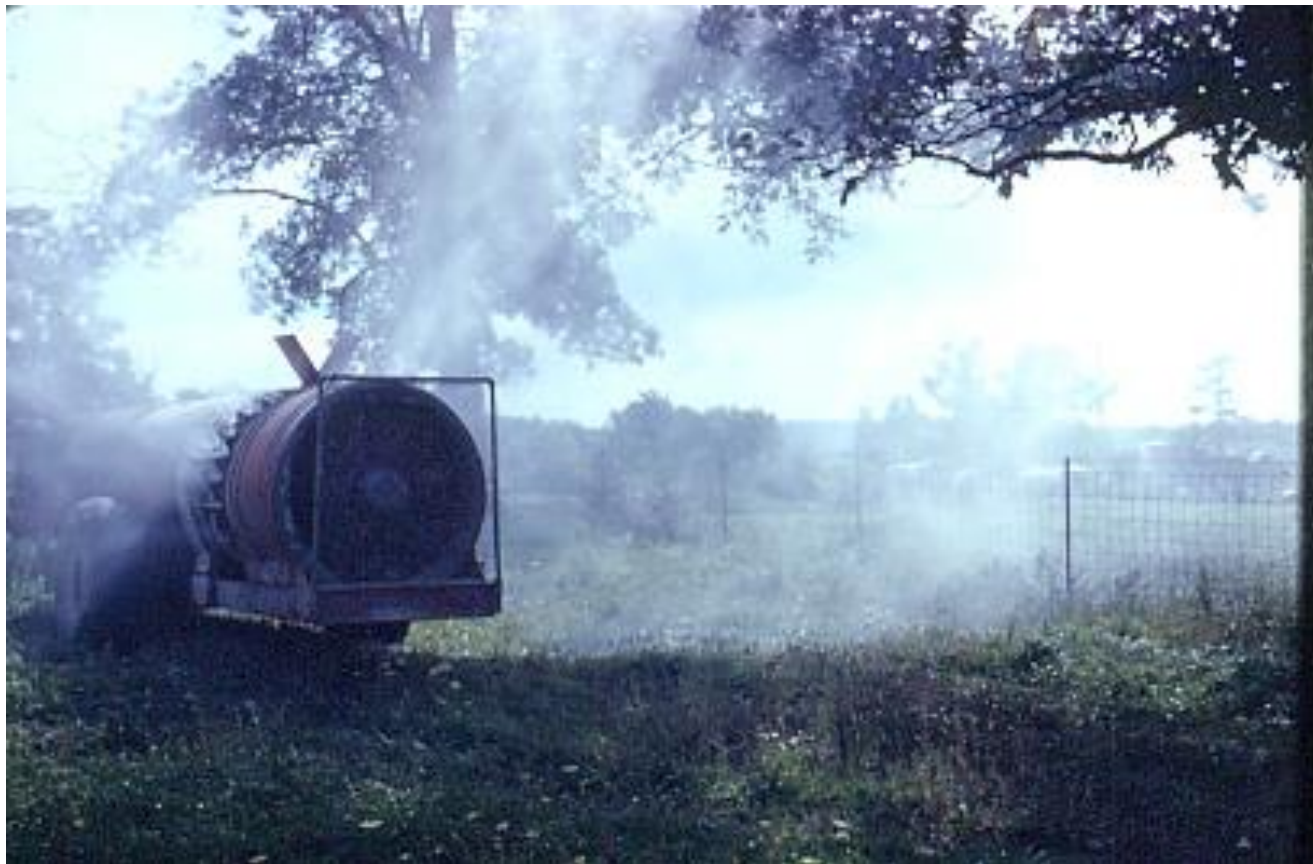
Drift and machinery