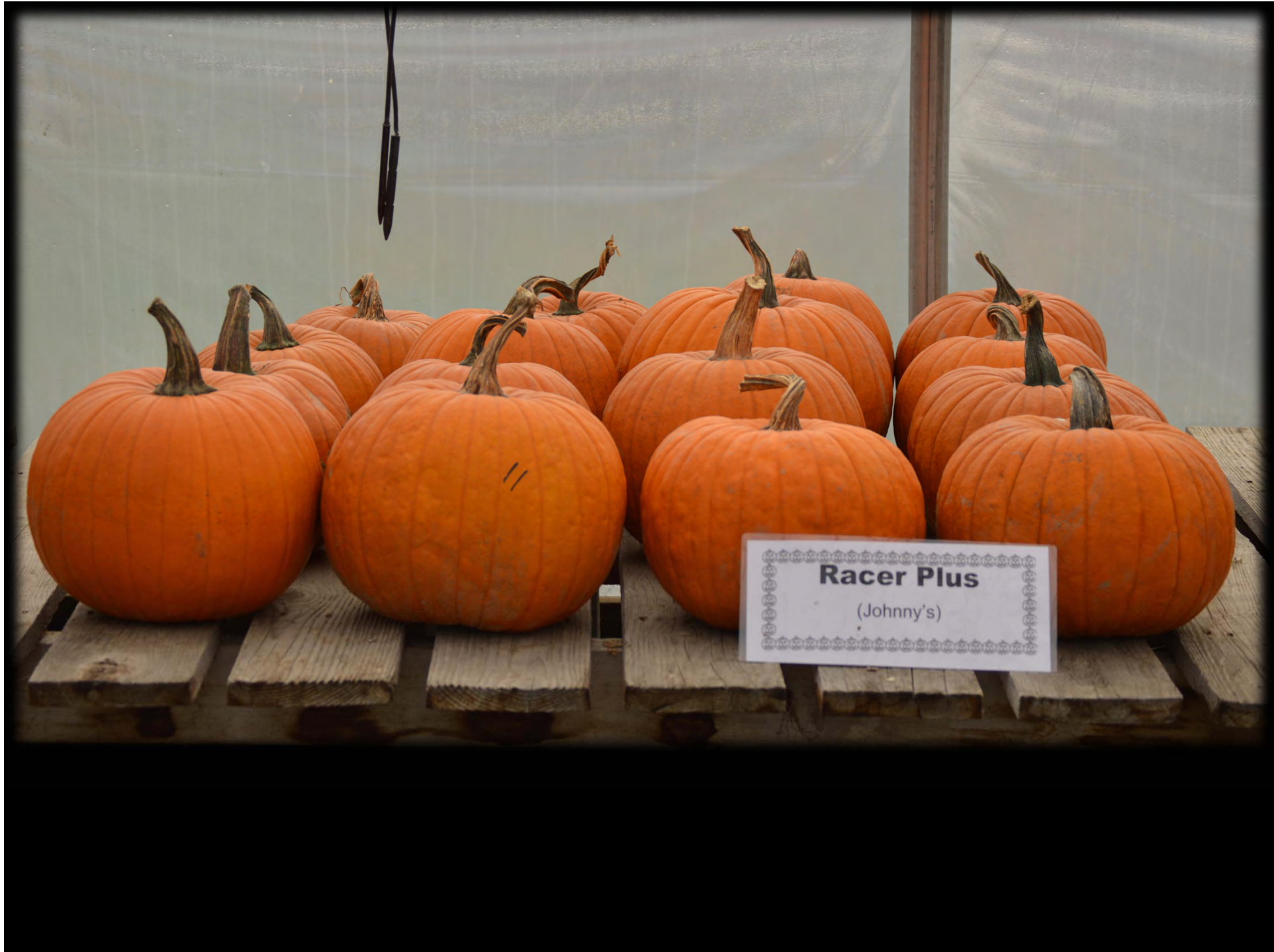
Racer Plus (Johnny's)