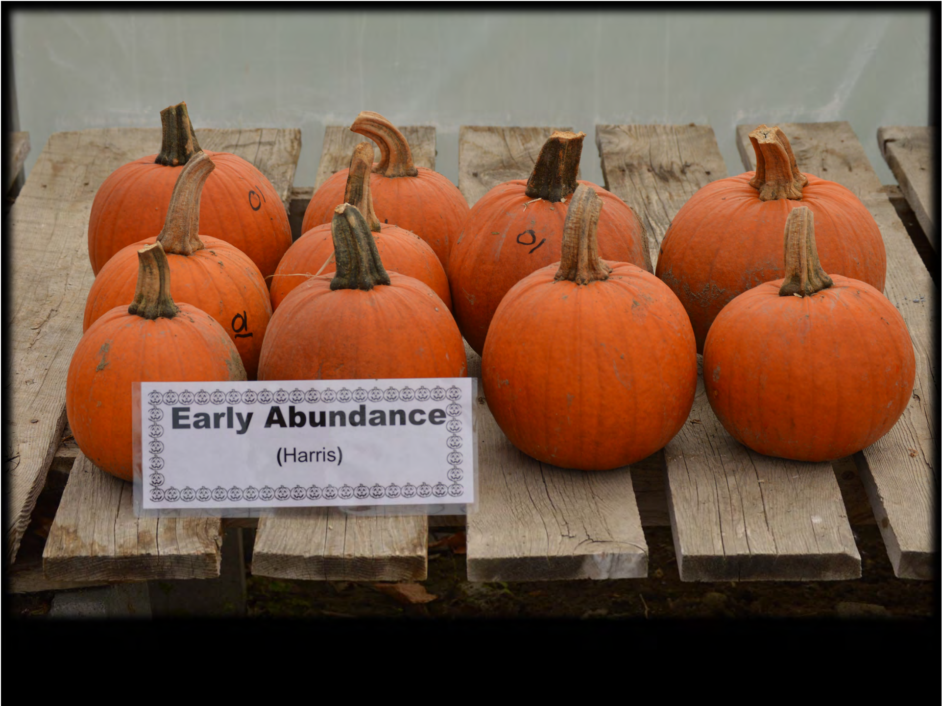
Early Abundance (Harris)