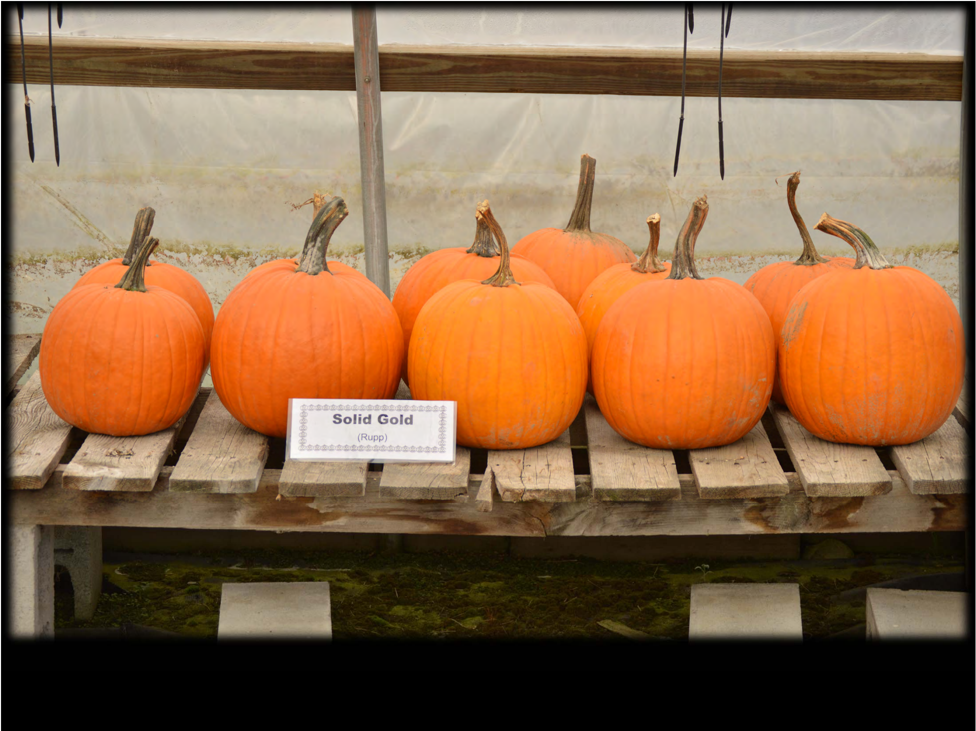
Solid Gold (Rupp)