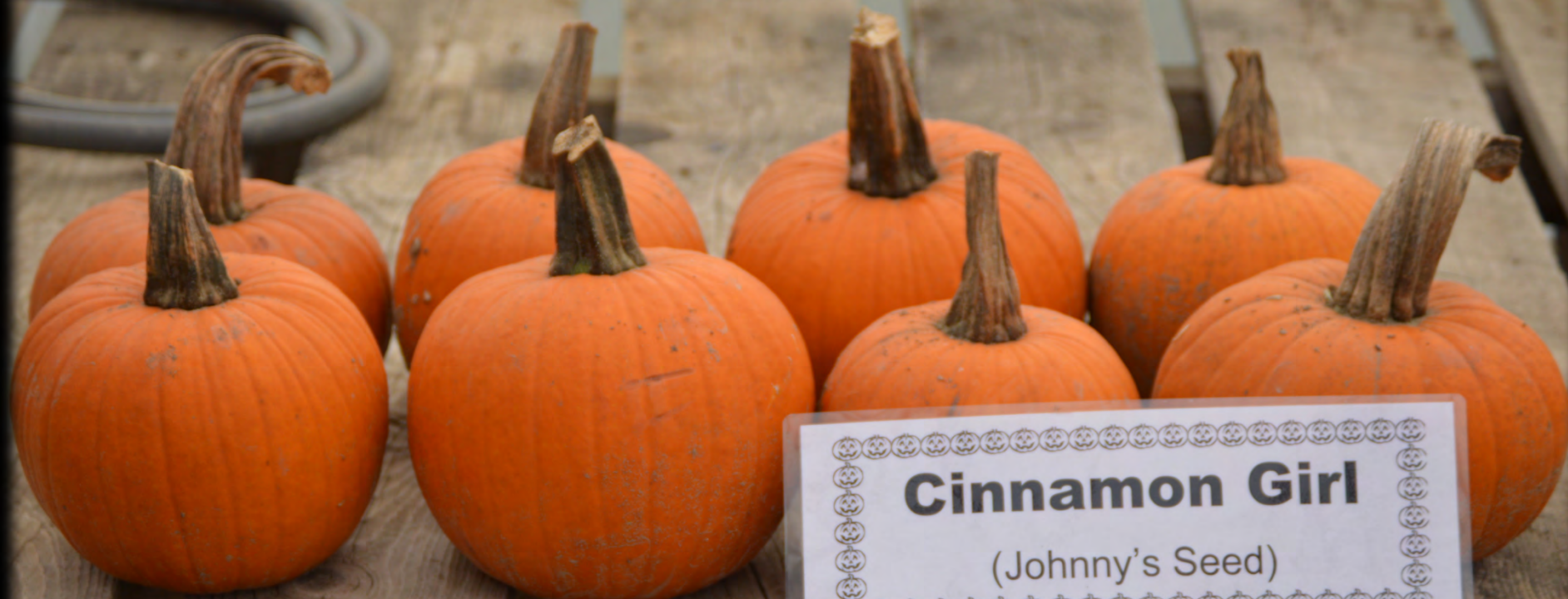
Cinnamon Girl (Johnny's Seed)