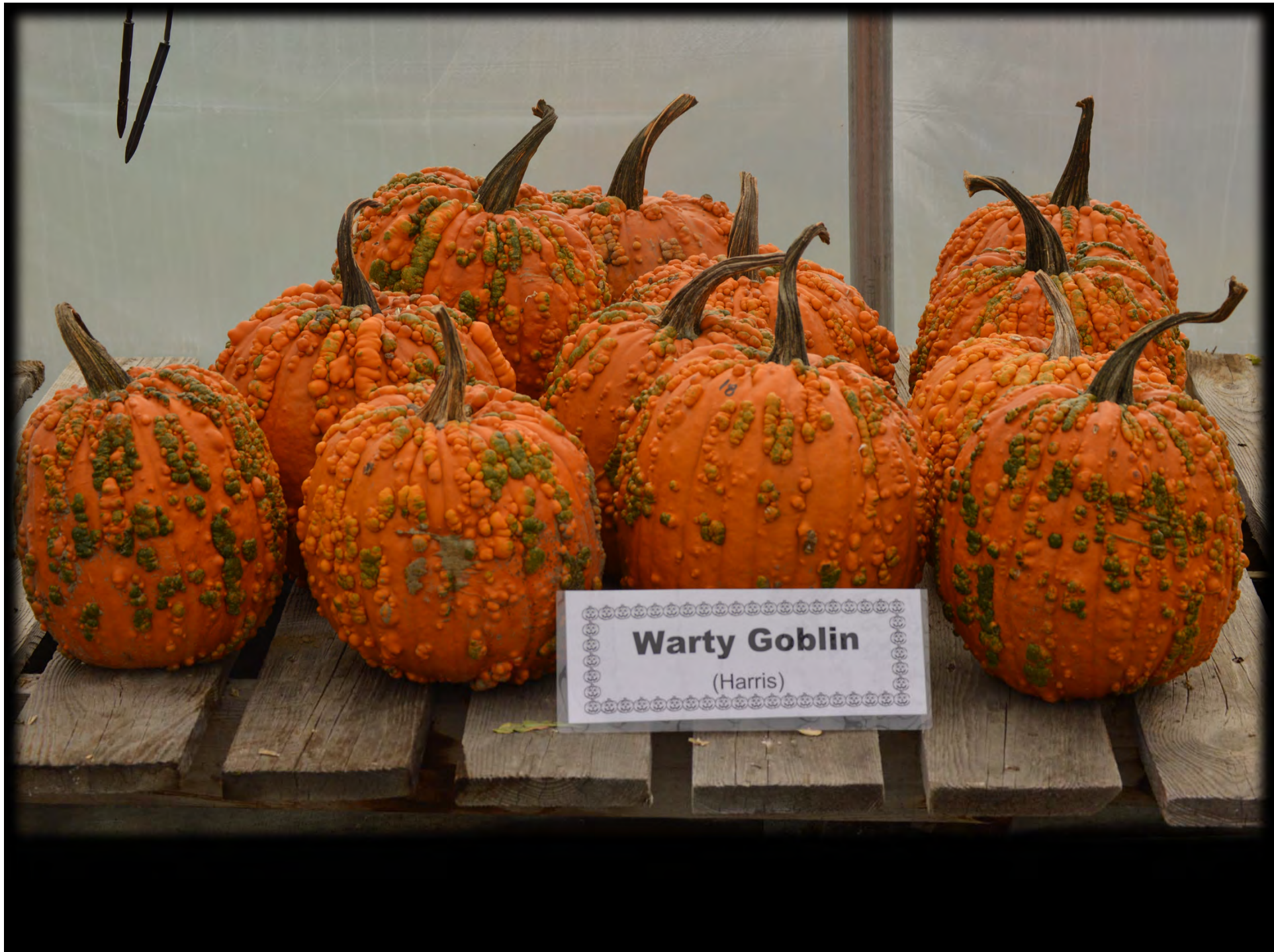
Warty Goblin (Harris)