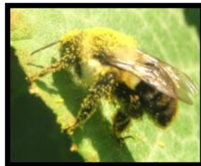
Common eastern bumble bee

On an individual basis, the common eastern bumble bee, Bombus impatiens , is the most efficient pollinator of pumpkin compared with other common species including the honey bee and squash bee, Peponapis pruinosa . Not only are bumble bees efficient pollinators, but they are also naturally abundant and available commercially, making it a perfect candidate as an alternative pollinator to honey bees in pumpkin fields.