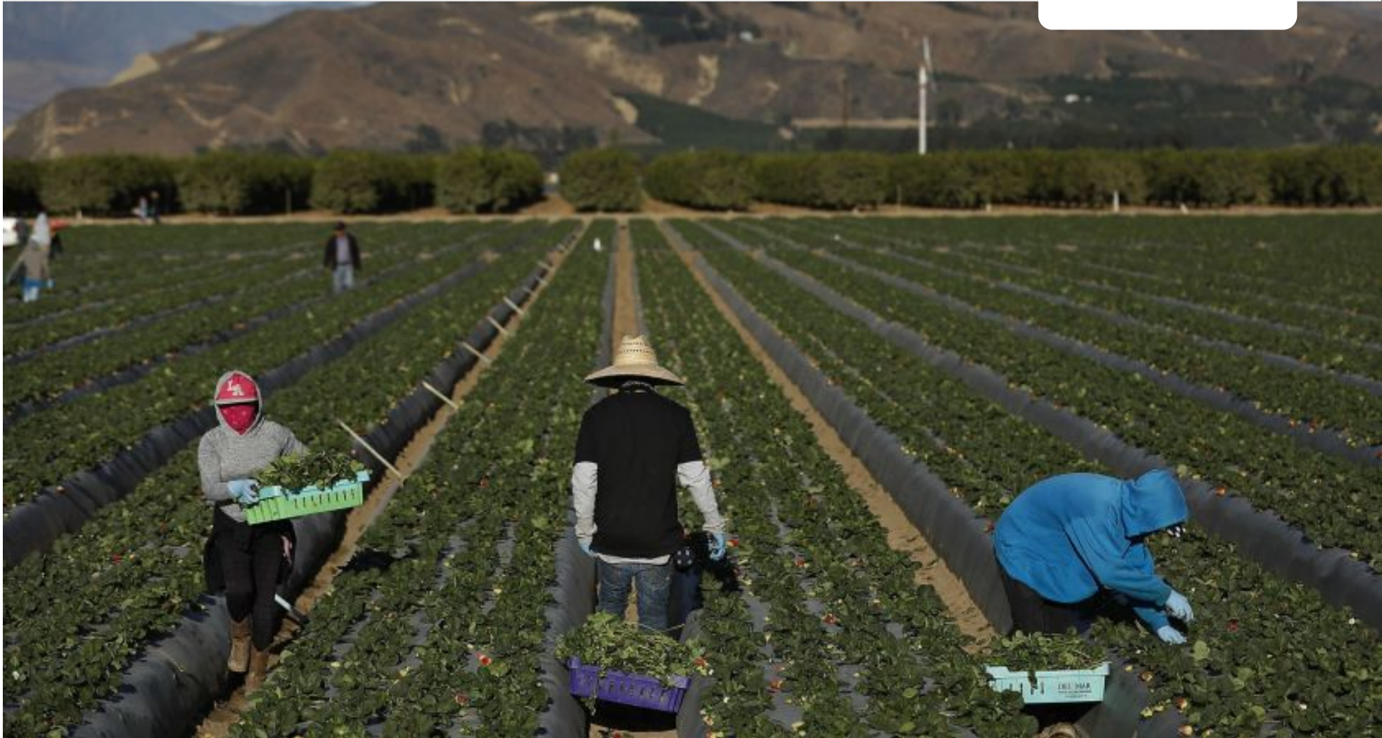
Farmworkers pick strawberries in a field in Oxnard.